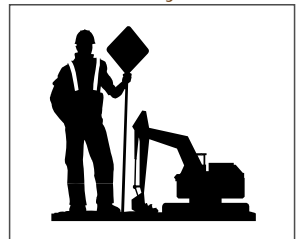
Watch for signs of road construction

Please remember to slow down when you are in construction zones, to ensure the safety of construction workers and equipment.