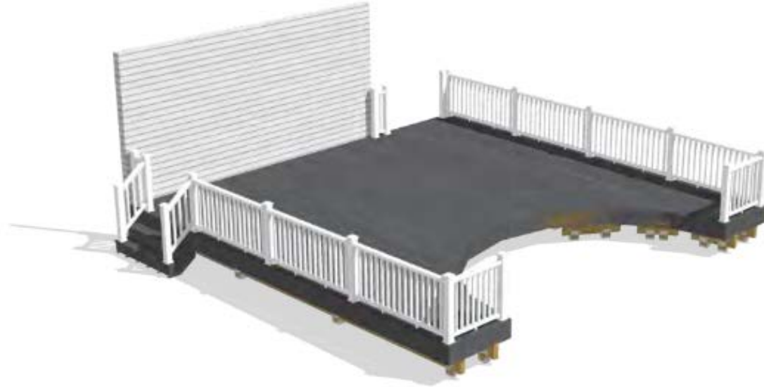
Waverly Deck 4.0